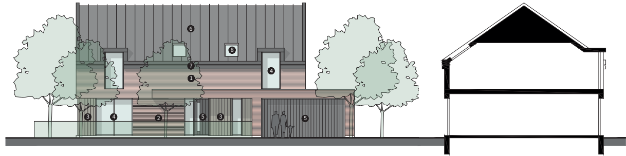
FE Front Elevation 1:75 @ a1