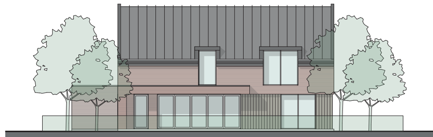
RE Rear Elevation 1:75 @ a1