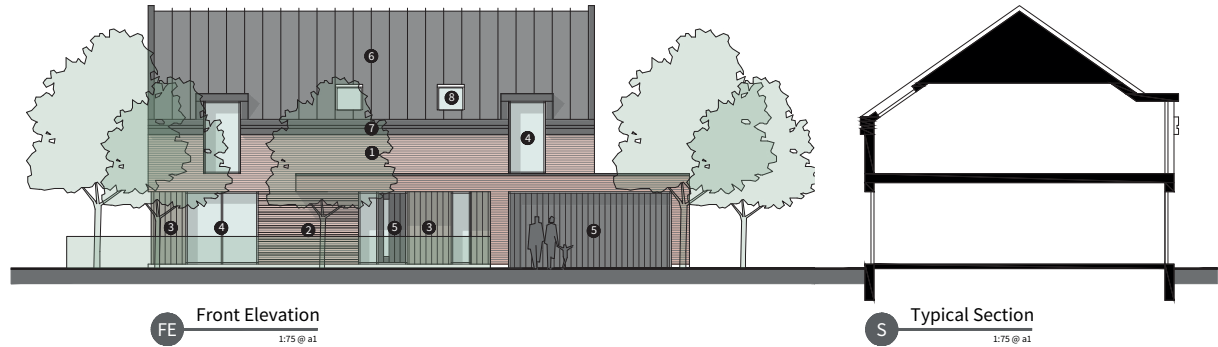
FE Front Elevation 1:75 @ a1