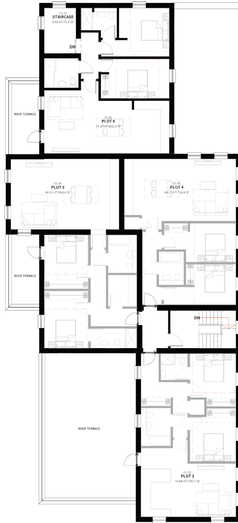
2 GA_Plan_01-First 1:100