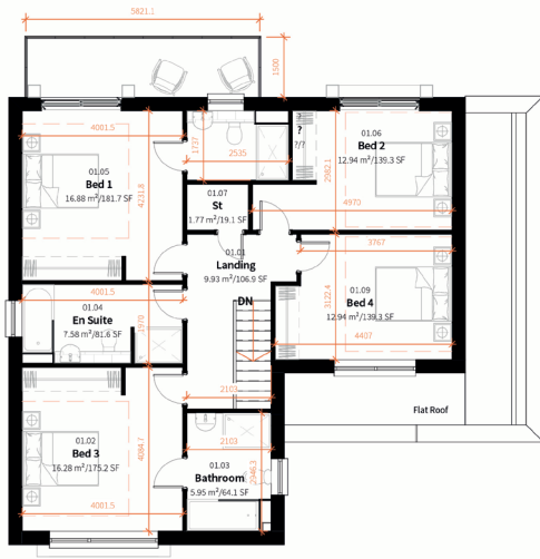
2 GA_Plan_01-First 1:100